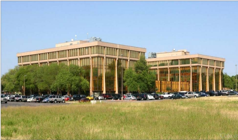
Photo: Twin Towers